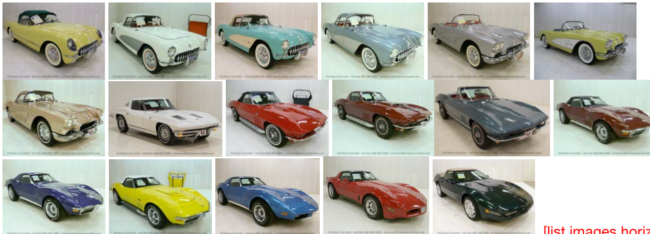
[list images horizontally

The Corvettes range from 1955 to 1992 and will remain in Napoleon, Ohio until late December and are available for pre-auction inspection.