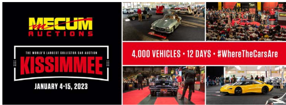
[Larger Image Header]

Seventeen ProTeam Corvettes... have been consigned to the Mecum Kissimmee, Florida Collector Car Auction that takes place January 4 th – 15 th , 2023 with these cars running on Thursday and Friday, January 12 th and 13 th at the Osceola Heritage Park, 1875 Silver Spur Lane, Kissimmee, Florida.