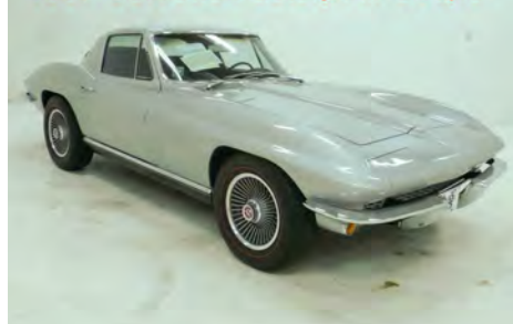
1967 Corvette Factory Air Coupe