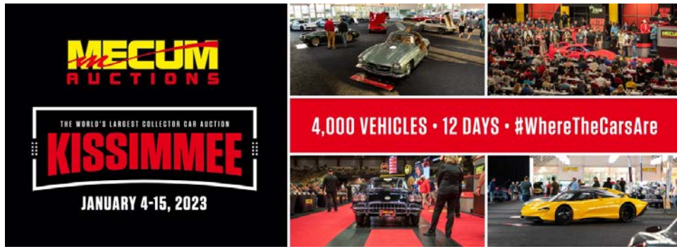
[Larger Image Header]

Seventeen ProTeam Corvettes... have been consigned to the Mecum Kissimmee, Florida Collector Car Auction that takes place January 4 th – 15 th , 2023 with these cars running on Thursday and Friday, January 12 th and 13 th at the Osceola Heritage Park, 1875 Silver Spur Lane, Kissimmee, Florida.