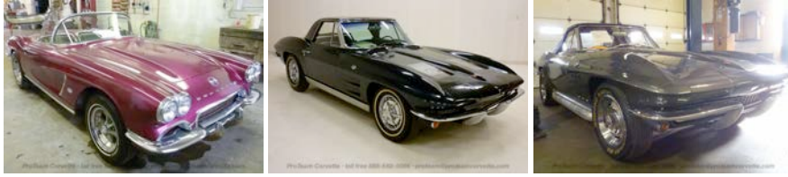
(Note: wrap text)

Three New Corvette Purchases... have just arrived at ProTeam's Napoleon, Ohio facility and are available for viewing and purchase. Many of these Corvettes are among the "Best of the Best." Here is our short list: