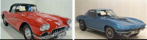
Year End Sale 2018 Year End Sale 2018 (Note: wrap text)

Tick Tick Tick... ProTeam's Year End Sale ends in a few days. Great cars with great prices and ProTeam will store your new purchase free until April 15th, 2019. All cars must be funded by January 2 nd , 2019. Personal and company checks are acceptable. Click here to view ProTeam's Year End Sale prices, descriptions, and photos. Questions? Email: terry@proteamcorvette.com