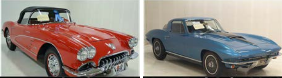
Year End Sale 2018 Year End Sale 2018 (Note: wrap text)