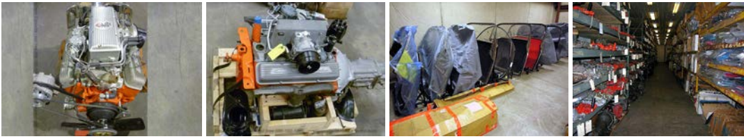
(Note: wrap text)

Rare Corvette Parts: 1960-61 F.I. unit pt. no. 7017320, $4,500.00; 1962 F.I. engine with F.I. unit, distributor, air cleaner, dated T-10 transmission, 901/902 exhaust manifolds, starter, generator, bell housing, oil filter, canister and shifter, (rebuilt) – (dated J-4-1, stamped F1012RF – 2102515) photoed above, $22,500.00; 1963 F.I. engine with F.I. unit, distributor, shielding, exhaust manifolds, alternator, water pump and fan (rebuilt) dated A-23-3 and stamped F0204RF with no VIN (appears OEM stamp and pad) photoed above, $22,500.00; 1964-65 F.I. unit with distributor pt. no. 7017380 (rebuilt), $9,000.00; 1965 NOS transistorized F.I. distributor, $2,500.00; 1960-62 RPO-687 heavy duty brakes and suspension still on rolling chassis; 1960 HD rear big brake shocks pt. no. 5554593 dated 3-A-60; and 1958-59 low script valve covers... much more 1953-75 parts available. Email: terry@proteamcorvette.com on F.I. motors