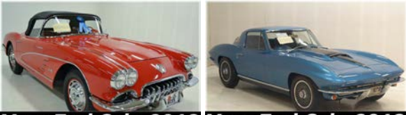
Year End Sale 2018 Year End Sale 2018 (Note: wrap text)