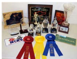
(Note: wrap text)

Contact terry@proteamcorvette.com should you have a rare Corvette or Corvette collection and need advice as it relates to estate planning, estate resolution/liquidation as it relates to auctions and/or our outright purchase.