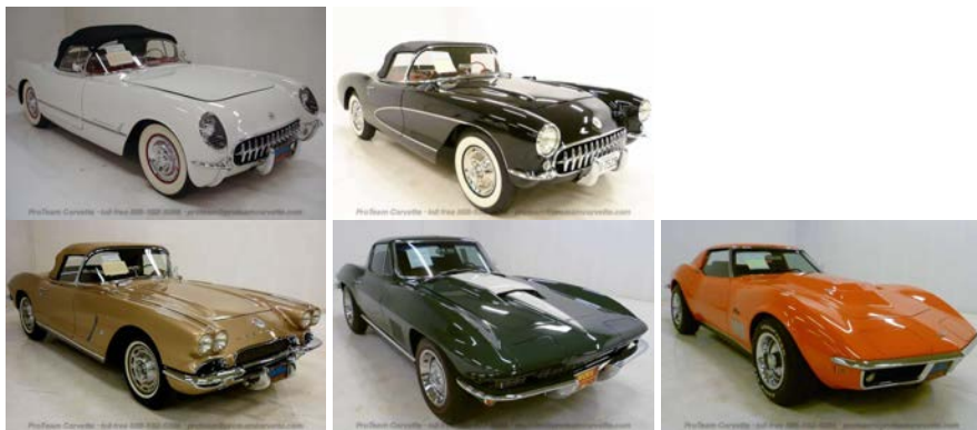
(Note: wrap text)

We are looking for a SALESPERSON that likes old cars and would like to meet people from around the world. Prefer energetic young person or retiree. brian@proteamcorvette.com