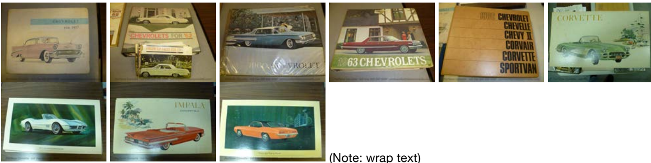
(Note: wrap text)

Corvette Memorabilia For Sale... Dealer showroom 18"x 32" hardboard posters $100.00 to $500.00 each (years available: 1960 Corvette, 1969 Corvette Convertible, 1970/72 Corvette TTop, 1972 Corvette TTop w/1953 inset, 1973 Corvette TTop, 1975 Corvette TTop, 1960 Red Impala Convertible, 1969 Camaro Sport Coupe, 1982 Chevy Stepside Pick-up w/1982 Chevy Fleetside Pick-up, 1982 Chevy S10 Sport Pick-up w/1982 Chevy S10 Tahoe Pick-up) – Dealer showroom albums (years available: 1960, 1962 with fingertip fact book, 1963, 1964, 1966 with fingertip fact book, 1967, 1968, 1969, 1973 with salesman product information, and 1975) $400.00 to $500.00 each – Corvette News/Corvette Quarterly collection (complete) – Dealer promo models – Miniature scale models – Blue Bars collection – Good Times collection – Corvette Restorer collection – Corvette Driveline collection – Keeping Track of Corvettes collection – Vette Vues collection – Corvette American Legend collection – Bloomington Gold Special Collection Booklets – Corvette owners manuals – Corvette sales brochures – Corvette assembly manuals. Hundreds of out of print books and magazines. Questions? Email terry@proteamcorvette.com