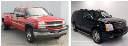
(Note: wrap text)

Corvette Memorabilia For Sale... Dealer showroom 18"x 32" hardboard posters $100.00 to $500.00 each (years available: 1960 Corvette, 1969 Corvette Convertible, 1970/72 Corvette TTop, 1972 Corvette TTop w/1953 inset, 1973 Corvette TTop, 1975 Corvette TTop, 1960 Red Impala Convertible, 1969 Camaro Sport Coupe, 1982 Chevy Stepside Pick-up w/1982 Chevy Fleetside Pick-up, 1982 Chevy S10 Sport Pick-up w/1982 Chevy S10 Tahoe Pick-up) – Dealer showroom albums (years available: 1960, 1962 with fingertip fact book, 1963, 1964, 1966 with fingertip fact book, 1967, 1968, 1969, 1973 with salesman product information, and 1975) $400.00 to $500.00 each – Corvette News/Corvette Quarterly collection (complete) – Dealer promo models – Miniature scale models – Blue Bars collection – Good Times collection – Corvette Restorer collection – Corvette Driveline collection – Keeping Track of Corvettes collection – Vette Vues collection – Corvette American Legend collection – Bloomington Gold Special Collection Booklets – Corvette owners manuals – Corvette sales brochures – Corvette assembly manuals. Hundreds of out of print books and magazines. Questions? Email terry@proteamcorvette.com