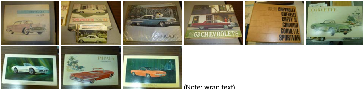
(Note: wrap text)

1967 Corvette 435 HP Display Motor... 3904351 four-bolt main block complete with intake, carbs, air cleaner, heads, distributor, shielding, braided wires, exhaust manifolds, alternator, water pump, cooling fan, valve covers and oil pan. This is a display motor from ProTeam Corvette in Napoleon, Ohio. $5,995.00 plus shipping and crating . Click here to see the gallery of photos. Contact terry@proteamcorvette.com . Others available.