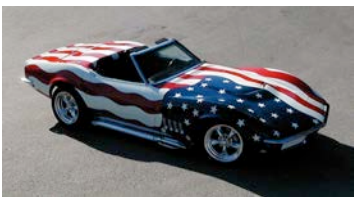
(Note: wrap text)

The Bloomington Gold Collection is normally comprised of 30 to 50 rare Corvettes that are selected and displayed by invitation only which is a real honor if you think about it as it represents such a small percentage of the over 1.5 million Corvettes that have been produced in 64 years. For more information on these two rare Corvettes, click on the stock numbers and for more information on the Bloomington Gold Show, go to BloomingtonGold.com . Comments or questions, email: terry@proteamcorvette.com