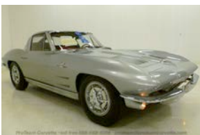
(Note: wrap text)

The standard is set by the various judging venues, ie: Bloomington Gold, NCRS, MCACN, and the Concours D'elegances scattered around the USA. It takes knowledge, preparation, and presentation to compete in these show venues. ProTeam's small group of employees possess that knowledge which should add additional value and a comfort level that you cannot and will not get from any other Corvette seller or reseller. POINT MADE! Think about it and Click Here to view the text file of our impressive show results. Comments or questions? Email: terry@proteamcorvette.com