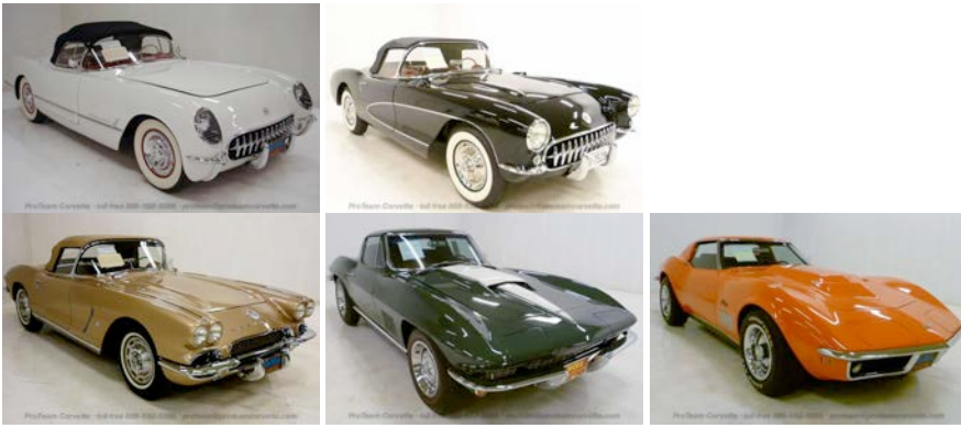
(Note: wrap text)

What Is My Corvette Worth? I get asked this question almost everyday. The value of a Corvette is directly related to venue, location, day, and time of day if offered at auction. High profile collector car auctions offer maximum exposure and hundreds or thousands of affluent “ready to spend” registered bidders that like the auction excitement and instant gratification of making a purchase and thus outbidding others. In essence they are the winner!