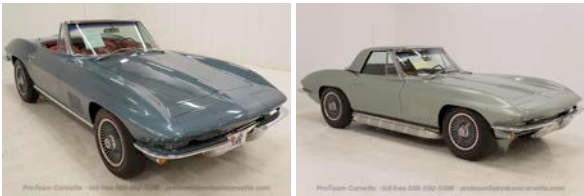
(Note: wrap text)

Two Very Rare ProTeam Corvettes... have been invited to be displayed at this year's Bloomington Gold Collection at the Indianapolis Motor Speedway on June 22 nd – 24 th , 2017. They are as follows: