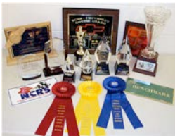
(Note: wrap text)

Contact terry@proteamcorvette.com should you have a rare Corvette or Corvette collection and need advice as it relates to estate planning, estate resolution/liquidation as it relates to auctions and/or our outright purchase.