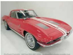
(note: wrap text)

For more information, descriptions, photos, and prices, click on our stock numbers or visit ProTeam's New Arrival page and click here to visit ProTeam's website and complete Corvette inventory. Questions and/or comments? Email: terry@proteamcorvette.com